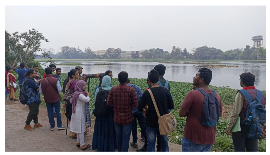
Learning on field by the Department of Zoology