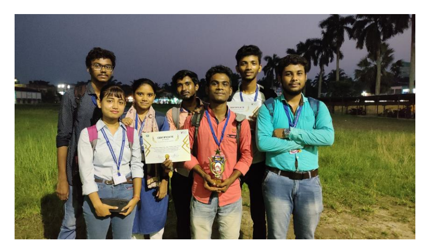
Participated and won medal and certificate in an intra-college event