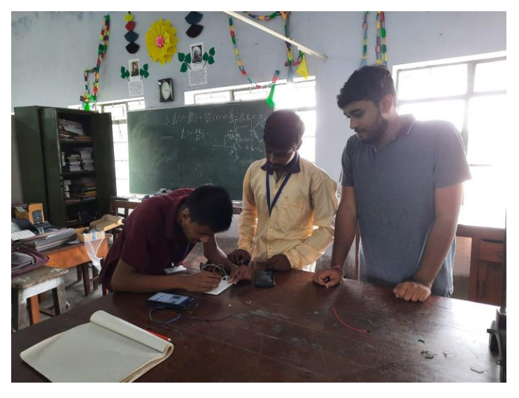
Experiencing the joy of learning by making an electronics circuit in a beadboard