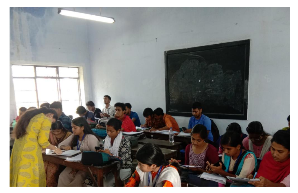
Students are busy in a Problem Solving Session in presence of the faculty at the Department of Mathematics