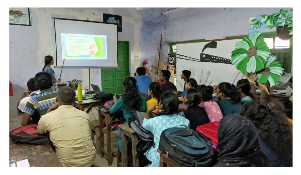
Presenting her thoughts in a Student Seminar at Department of Zoology

In an era where education is evolving rapidly, the focus is shifting towards methodologies that place students at the heart of the learning process. This paradigm shift acknowledges that education is not merely about transferring knowledge but is a dynamic process that involves active engagement, critical thinking, and problemsolving. As we navigate the landscape of student-centric methods, we discover a rich tapestry of approaches designed to empower learners, foster creativity, and prepare them for the challenges of an ever-changing world.