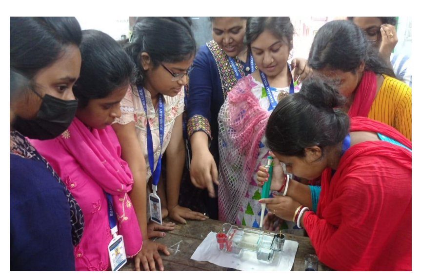
Learning by doing