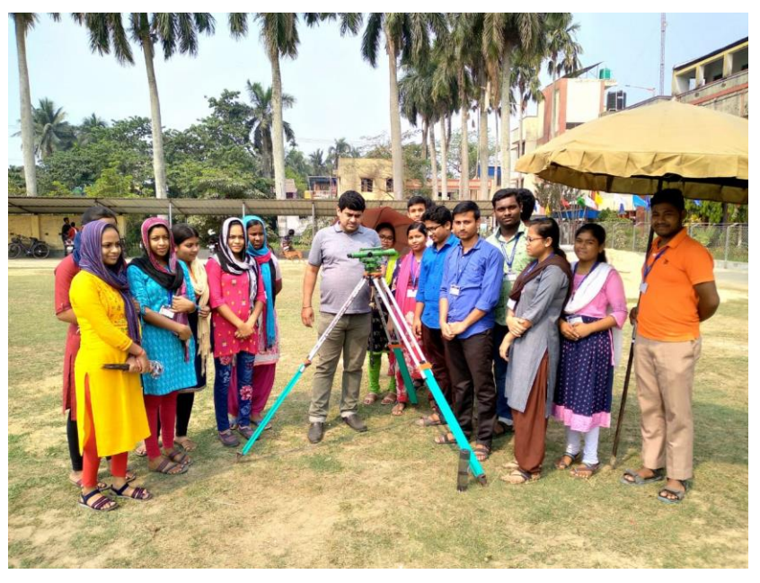
Students participating demonstration class at the Department of Geography