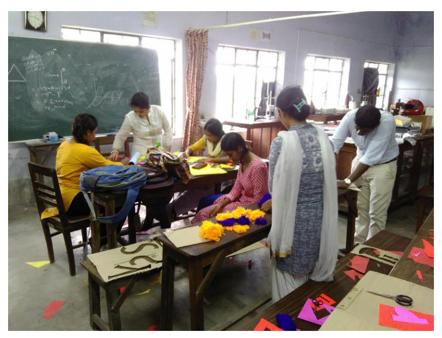
Students enjoying the participation in making of hand work