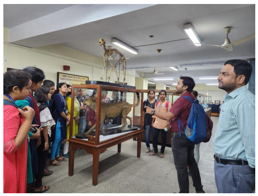
Teacher explaining the subject on the field