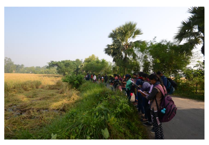
Learning on field by the Department of Zoology